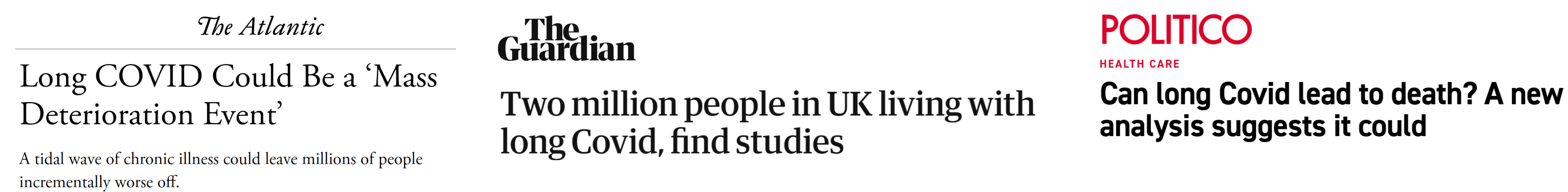
Figure 1. A sampling of media coverage of long COVID from Spring 2022

Background: “Post-acute COVID-19 syndrome” or “long COVID” are persistent symptoms that continue for weeks or months following the acute COVID-19 disease. As the COVID-19 pandemic continues, long COVID poses a significant public health issue with potential to inflict mass disability [1]. Clinicians have varying familiarity in the characteristic symptoms associated with long COVID, creating challenges in defining and measuring this issue at scale.