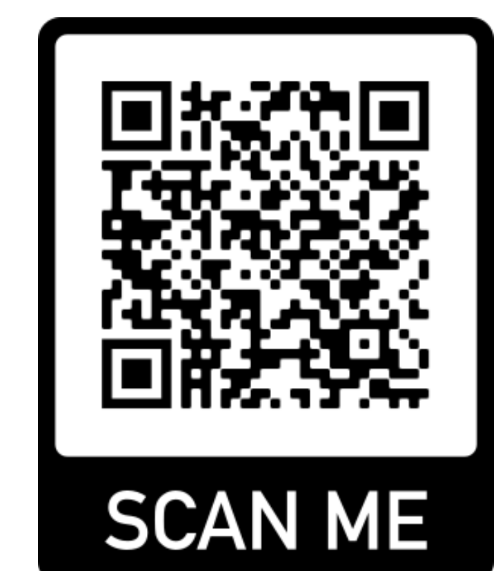
Figure 3. CohortDiagnostics Shiny Application for Study